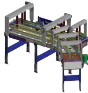
Quick change guide rail

Infinity Machine & Engineering Corporation is a full service conveyor supplier- meaning we can design plant layouts, build the systems both mechanically and electrically, set-up the systems at our facility for customer check-outs (as space allows), install and program the system to work efficiently. Utilizing PLC control and variable speed drives, we can vary conveyor speeds based on the operating requirements of the line. This type of intelligent system increases operating throughput and decreases the likelihood of product damage on the conveyor system.