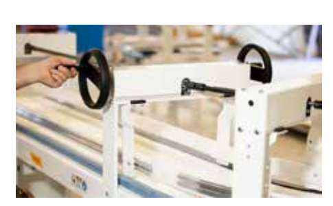
Standard Guide Rail